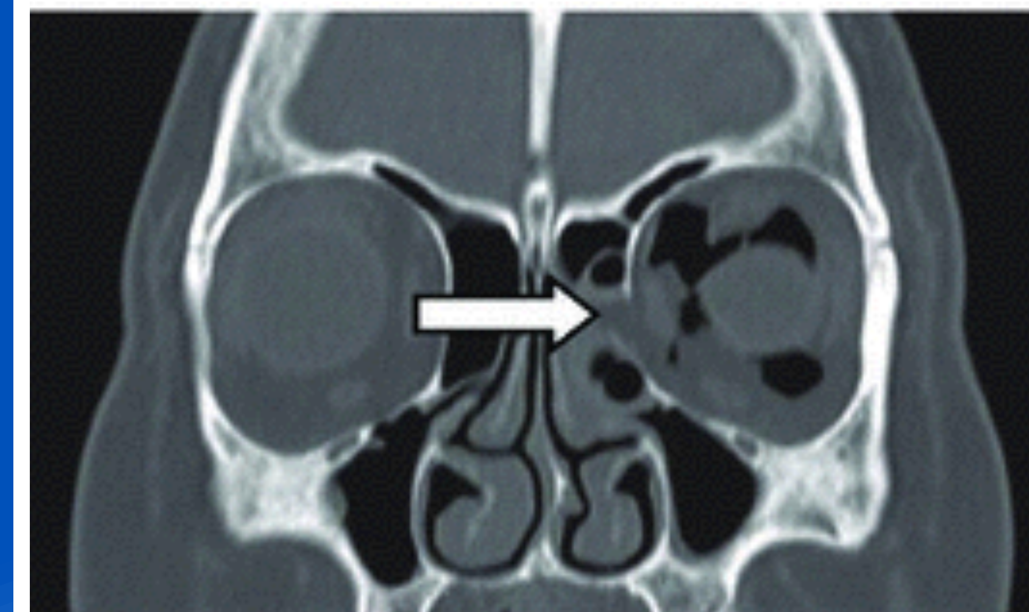
Figure 3 Sagittal CT in soft tissue window width. Demonstrating blow out fracture of the left orbital floor with orbital fat herniation. Periorbital and orbital emphysema revealed. (Ariyoshi et al., 2019, p. 2)

The underlying cause of SE should be first analyzed in treatment. In mild cases, observation is applicable. Resolution of SE most often occurs in less than 10 days if underlying diagnose is controlled (Kukuruza & Aboeed, 2021, p. 2).