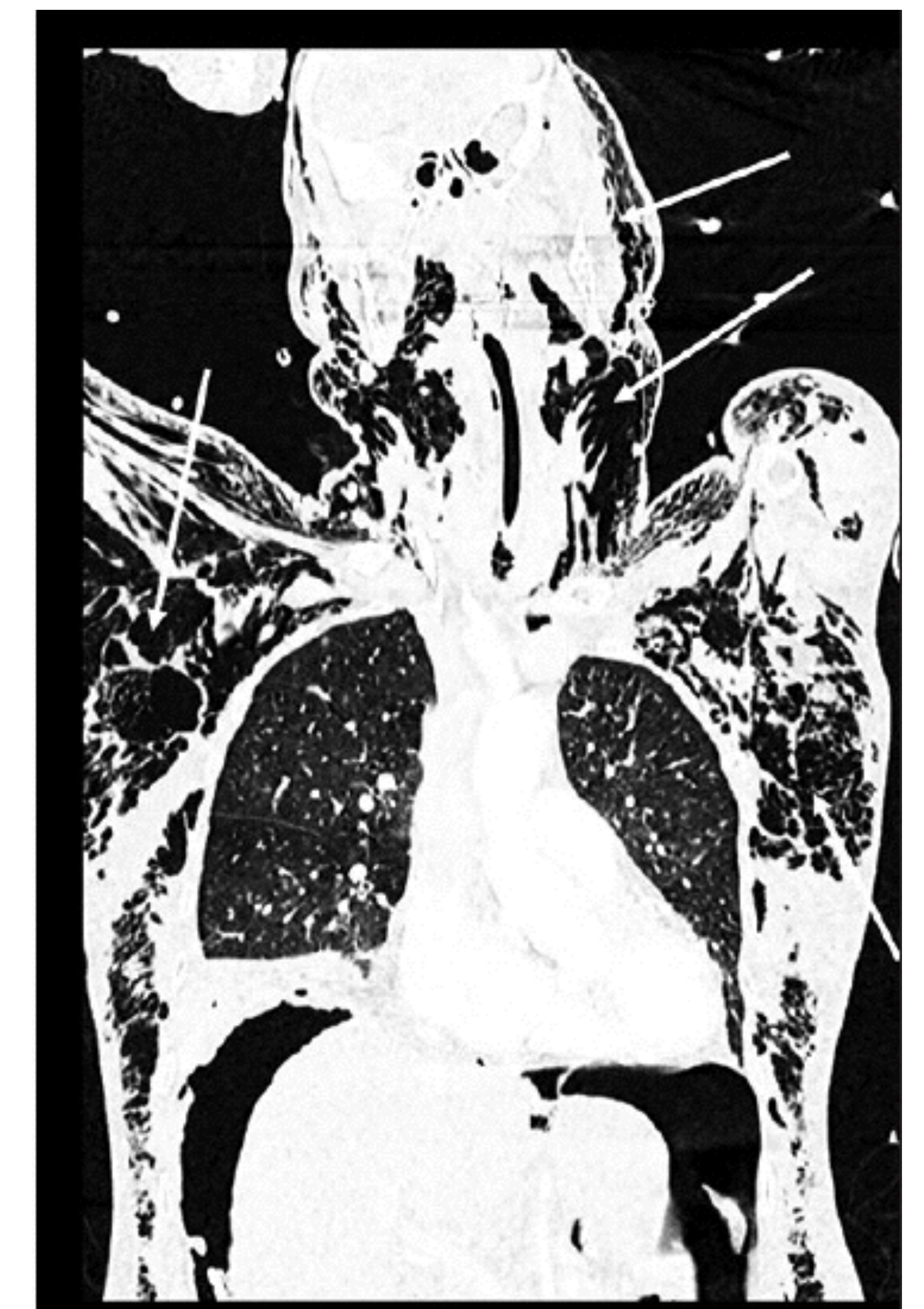
Figure 4 Reconstructed sagittal CT in bone window width. Demonstrating subcutaneous emphysema throughout thorax, neck and skull. (Diop et al., 2021, p. 107)

SE may be a iatrogenic (caused by medical treatment) consequence from surgery. For example the presence fo SE after a colonoscopy is common due to the diffusion of insufficient carbon dioxide gas thought the subcutaneous tissue (Diop et al., 2021, p. 107). Aiding in diagnosis, CT is used to determine diagnosis and differentiate SE. alveoli rupture and barotrauma.