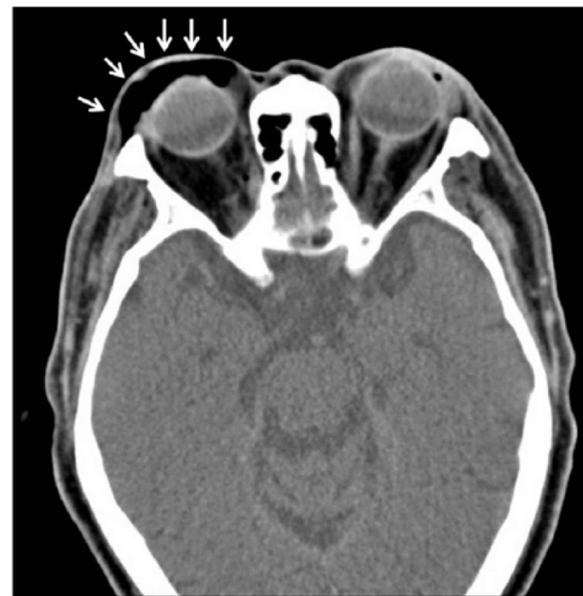
Figure 2 Coronal slice of a CT maxillary face in a soft tissue window width. Demonstrating subcutaneous emphysema surrounding right orbital cavity, periorbital cavity and infra temporal fossa. (Chan, Lio, Yu, Peng, & Chan, 2020, p. 177)