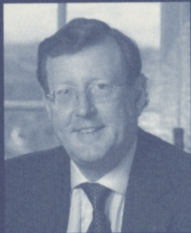
Rt. Hon. W. David Trimble, MP, MLA